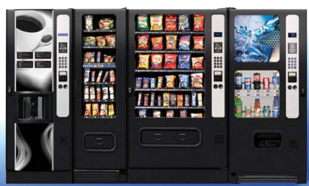
Full Line Vending Products & Services

Right-sized addition to your food service.